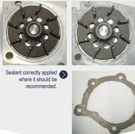
Sealant correctly applied where it should be recommended.

applied a gross film of sealant paste, it can be lost the perfect parallelism between two contact surfaces and then could be produced misalignment of the water pump pulley. A gross film of sealant paste can also produce water pump leakage in the way we describe below.