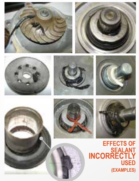
EFFECTS OF SEALANT INCORRECTLY USED (EXAMPLES)