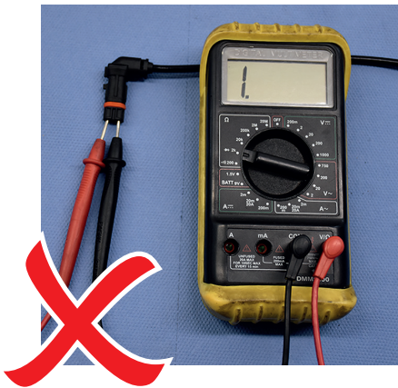
Multimeter (with ohmmeter resistance measurement)

Since the exact sensor type cannot be diagnosed externally (design, number of pins, magnetism, etc.), the OPTIMAL technology experts therefore recommend the use of an oscilloscope or a sensor test device. Caution: When using an ohmmeter you can destroy certain sensors.