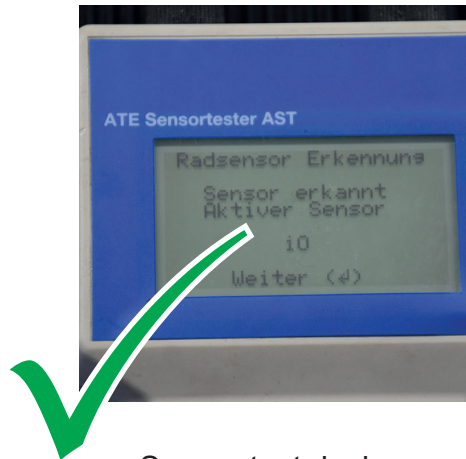
Sensor test device